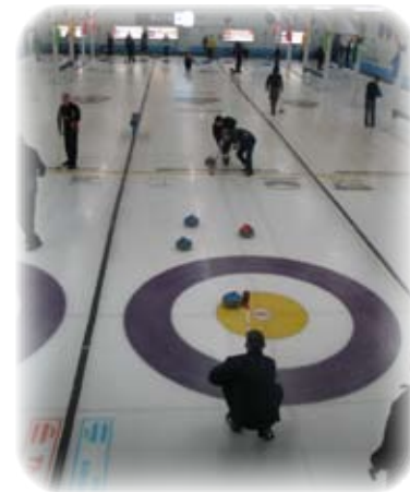
On-ice action from the Pac Rim Cup

On the Friday night, the crowd enjoyed a 1960's lounge-style theme. Morning coffee and snacks, followed by a Mimosa bar, helped keep the energy level high until the opening ceremonies at noon on Saturday, which were followed by the "Old Farts Cup" draw to the button competition.