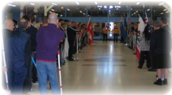
Pac Rim Cup Opening Ceremonies